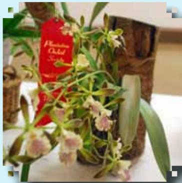
RED RIBBON E. Alata 'Epijim X E. Green Glades 'Jerry Templet' Dot McCrain