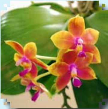
YELLOW RIBBON Phal. Guadalupe Gigi Louis