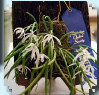
BLUE RIBBON Leptotes bicolor Gigi Louis