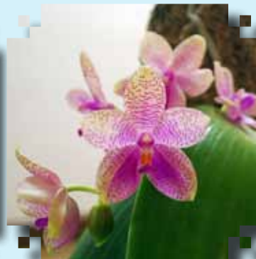
BLUE RIBBON Phal. Gigabell (Gigante X bellina) Gigi Louis