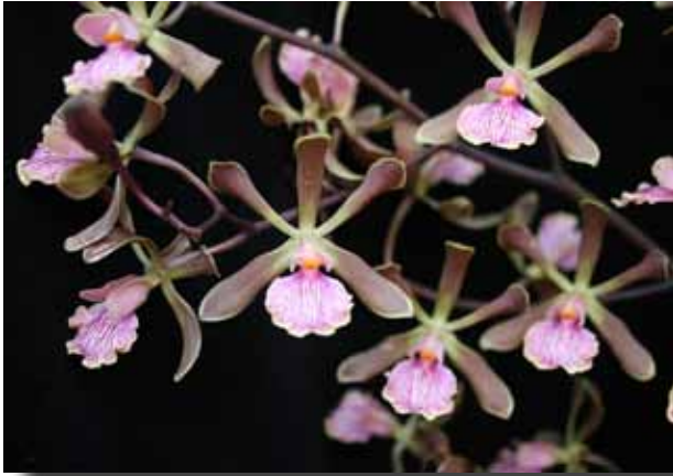
Our 2014 Photo Winner - Lynn Molitor