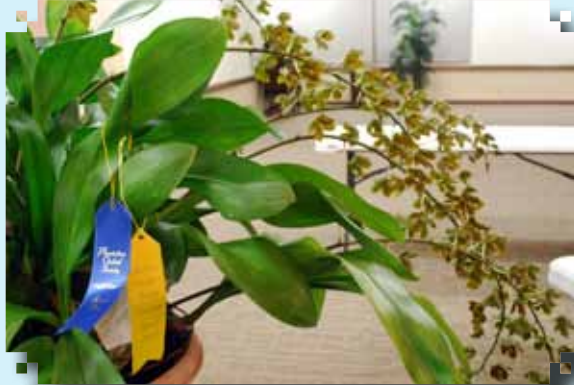
YELLOW/BLUE RIBBON Grammatophyllum W. Bill David