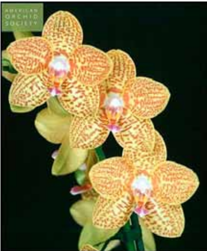
Phal. Brother Torro 'Plantation' HCC points-77 4/9/2001