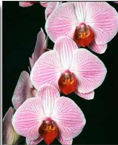
Phal. Chicago Connection 'Plan- tation AM points-81 3/25/1995.