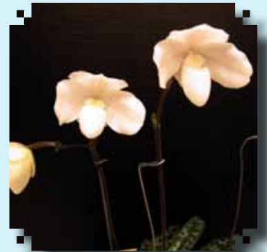
BLUE RIBBON Paph. Niveum Carole Schwimmer