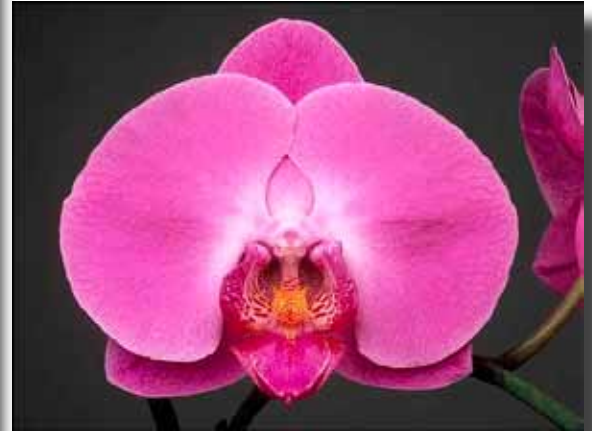
Phal. Plantation Beau 'Debbi' HCC points-77