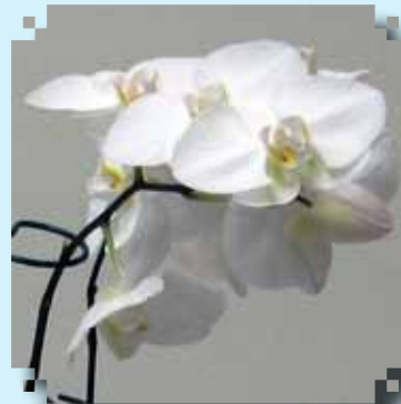
YELLOW RIBBON Phalaenopsis White"UFO" Mary Lee Tabeing

As a reminder, all plants brought in for the show table should be free of pests and diseases. Take some time to stake and clean the leaves of your plants, this allows for better presentation. Also, please do not bring newly-purchased plants for the show table. The show table is an outlet for members to share the great job they have done in growing and flowering their orchids; therefore, please respect the unwritten rule of owning and growing an orchid for a minimum of 6 months.