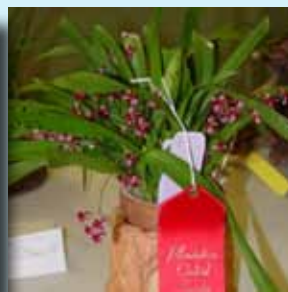
Red Ribbon - Onc. Twinkle Red Phyllis Durst