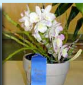
Blue Ribbon - Den. Spring Dream Helene Albee