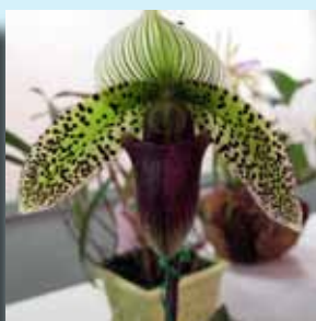
Blue Ribbon - Paph. Macabre Tony Blanc