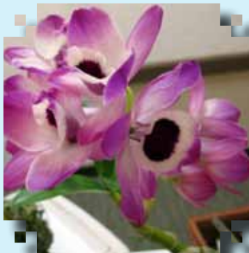
RED RIBBON Den. Nobile 'Sweet Candy' Tracy Moulton