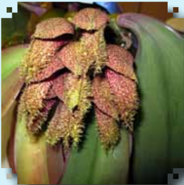
BLUE RIBBON Bulb Phal Rose Maytin