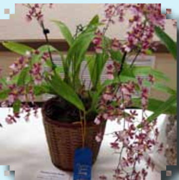
BLUE RIBBON Onc. Pacific Sunrise Phyllis Durst