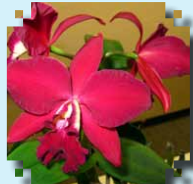
RED RIBBON C. Ann Komine 'Breathless' AM/AOS Phyllis Durst

As a reminder, all plants brought in for the show table should be free of pests and diseases. Take some time to stake and clean the leaves of your plants, this allows for better presentation. Also, please do not bring newly-purchased plants for the show table. The show table is an outlet for members to share the great job they have done in growing and flowering their orchids; therefore, please respect the unwritten rule of owning and growing an orchid for a minimum of 6 months.