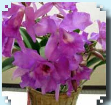
RED RIBBON BC Mai Kai 'Lee' x C. Skinneri 'Carpinteria' FCC/AOS