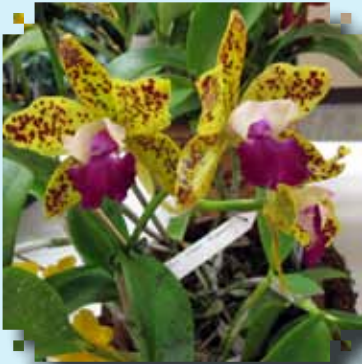
BLUE RIBBON Blc. Green Emerald Phyllis Durst

We were treated to a spectacular array of blooming babies in February!