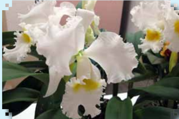
BLUE RIBBON C. Andean Mist Gigi Louis