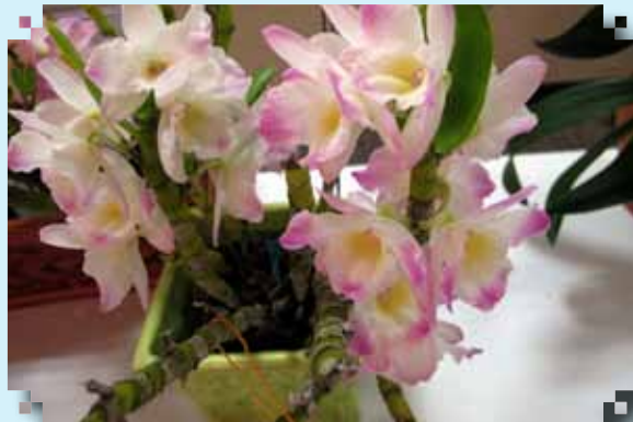
BLUE RIBBON Den. Spring Dream Helene Albee