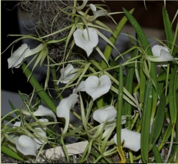
B. Nodosa Phyllis Durst