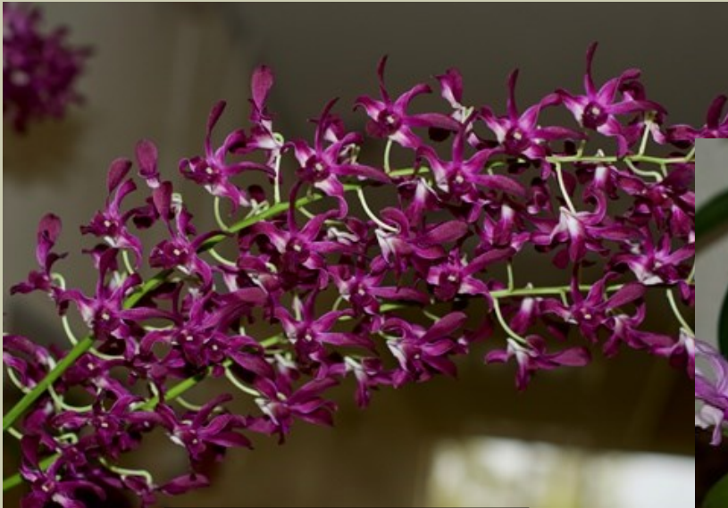
Den. Hawaiian Punch.