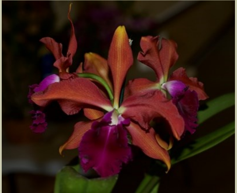
Lc. Amphion 'Show Time' Phyllis Durst