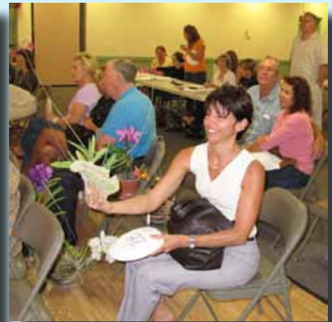
Another beautiful orchid finds a home