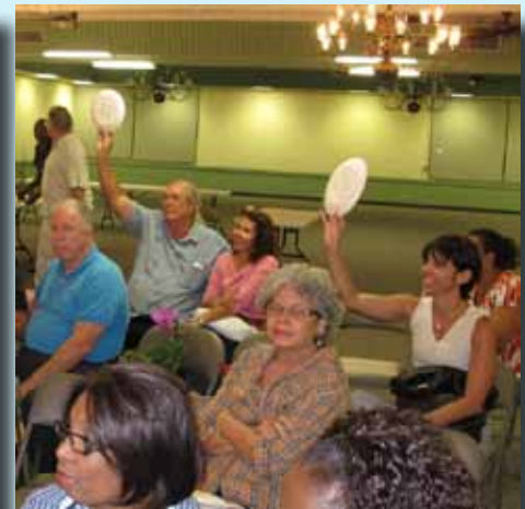
Hot and Heavy Bidding