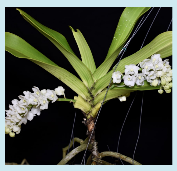
Rhy. Gigantea 'Alba' - Phyllis Durst Blue Ribbon