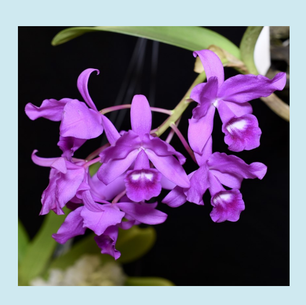
Cattleya Hail Storm - Elise Chapman Red Ribbon