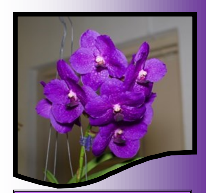
RED RIBBON No Id but still gorgeous Elda Scott