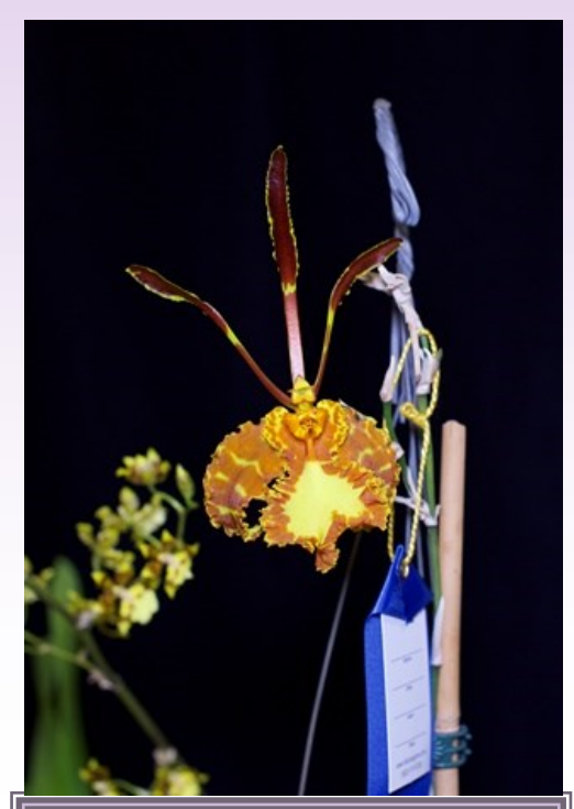
BLUE RIBBON Psychopsis Lynn Molitor