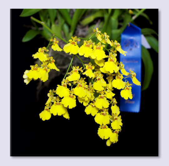
Onc. Sweet Sugar Jeff Tucker