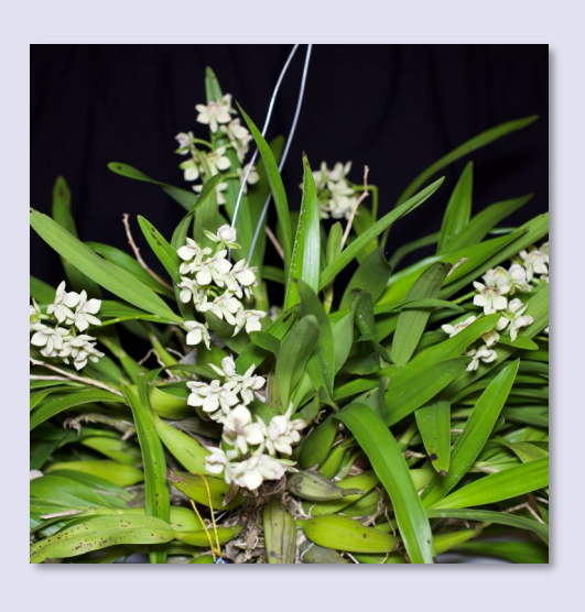
Enc. Fragrans Phyllis Durst