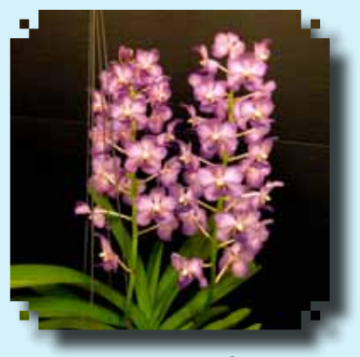
BLUE RIBBON Vascostylis Vanita Blue Jeff Tucker