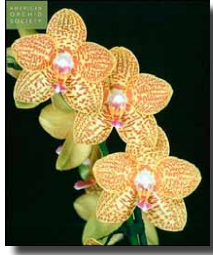
Phal. Brother Torro 'Plantation' HCC points-77 4/9/2001