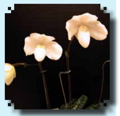
BLUE RIBBON Paph.. Niveum Carole Schwimmer