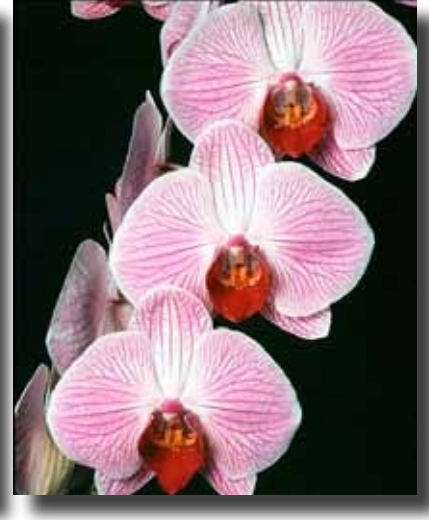
Phal. Chicago Connection 'Plantation AM points-81 3/25/1995.