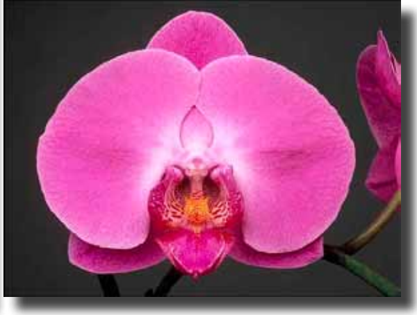
Phal. Plantation Beau 'Debbi' HCC points-77