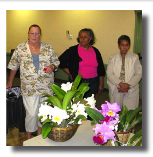
Members check out the ribbon winners