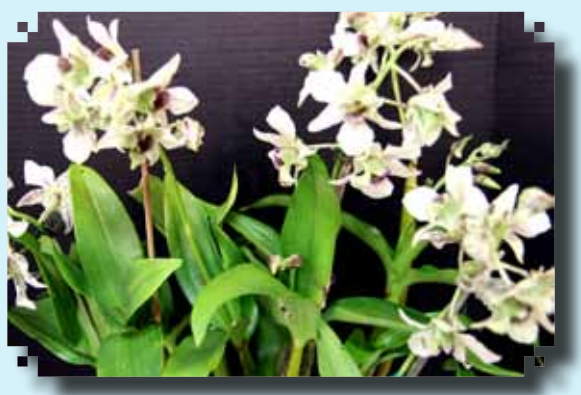
BLUE RIBBON Den. Roy Tokunaga x Den. Roy Tokuaga 'Spots' Phyllis DursT