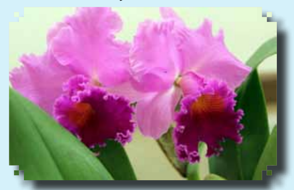
<u>BLUE RIBBON</u> CAT. Bonanza Queen 'Panamint' Jeff Tucker