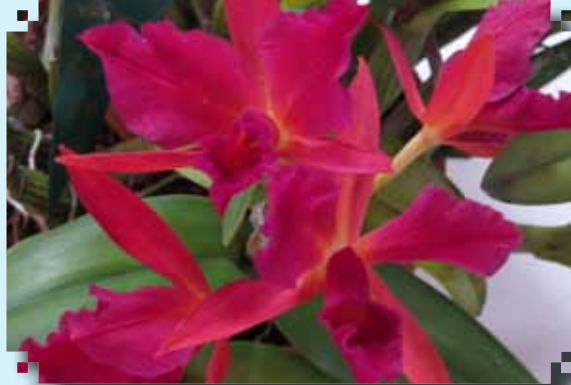
GREEN RIBBON Slc. Jewel Box 'Dark Waters' Phyllis Durst