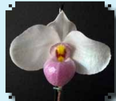
BLUE RIBBON Paph. Delenatii Tony Blanc