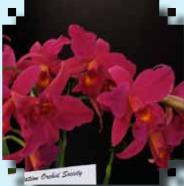
BLUE RIBBON Lc. Hsin Buu Lady 'YT' Jeff Tucker

Kudos to our members for another riot of color on our packed show table and apologies to those whose orchids are pictured but not credited. Several registrations were not collected.