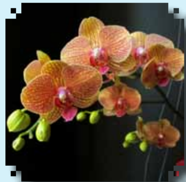
RED RIBBON Phal. Baldain's Kaleidoscope Tracy Moulton

As a reminder, all plants brought in for the show table should be free of pests and diseases. Take some time to stake and clean the leaves of your plants, this allows for better presentation. Also, please do not bring newly-purchased plants for the show table. The show table is an outlet for members to share the great job they have done in growing and flowering their orchids; therefore, please respect the unwritten rule of owning and growing an orchid for a minimum of 6 months.