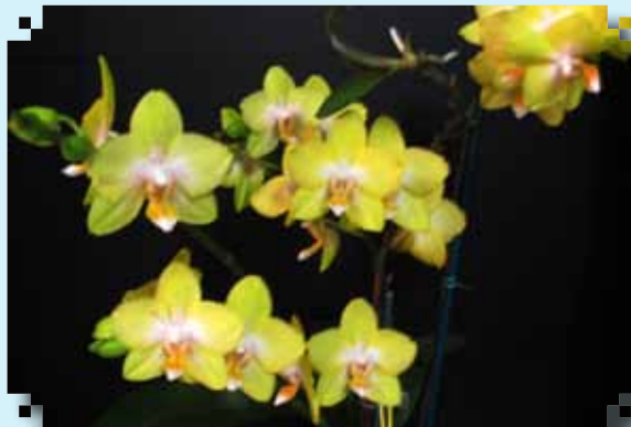
GREEN RIBBON Phal. Dragon's Gold '24k'