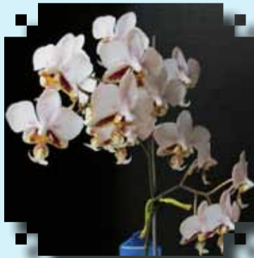
BLUE RIBBON Phal. Stuartiana