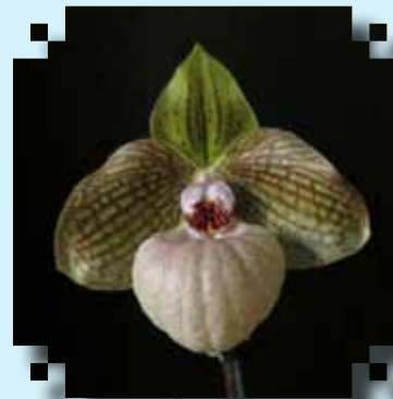
RED RIBBON Phal. Fantacum