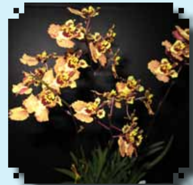
BLUE RIBBON Tolumnia Jairak Firm Carole Schwimmer