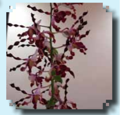
BLUE RIBBON Den. Lasienthera Helene Albee

As a reminder, all plants brought in for the show table should be free of pests and diseases. Take some time to stake and clean the leaves of your plants, this allows for better presentation. Also, please do not bring newlypurchased plants for the show table. The show table is an outlet for members to share the great job they have done in growing and flowering their orchids; therefore, please respect the unwritten rule of owning and growing an orchid for a minimum of 6 months.