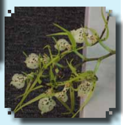
<u>BLUE</u> RiBBON Brs. New Start 'Galaxy' Rose Maytin