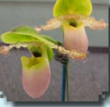
BLUE RIBBON Paph. Pinocchio Jeff Tucker