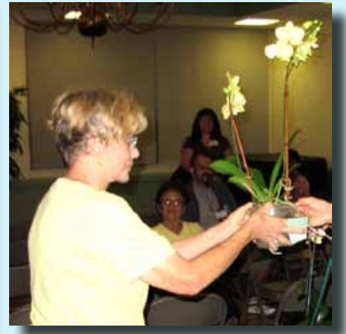
Another lucky winner.