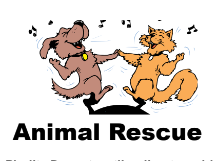
Phyllis Durst is still collecting old towels and blankets for animals in rescue shelters. If you have any towels or blankets that you would like to get rid of, please bring them to our meeting Tues. and give them to Phyllis.