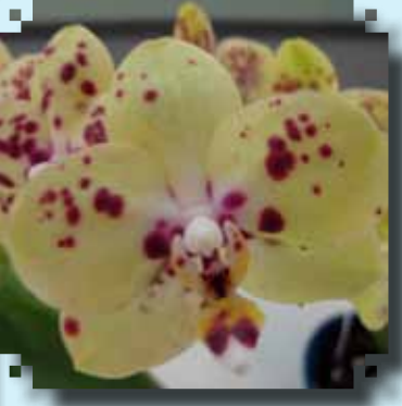
RED RIBBON Phal. Sogo Pearl Phyllis Durst