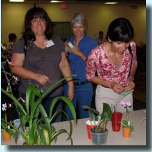
Admiring the Raffle Table