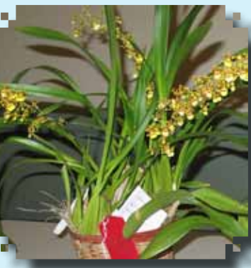
<u>RED</u> RIBBON Onc. Sphacelatum Phyllis Durst

As a reminder, all plants brought in for the show table should be free of pests and diseases. Take some time to stake and clean the leaves of your plants, this allows for better presentation. Also, please do not bring newlypurchased plants for the show table. The show table is an outlet for members to share the great job they have done in growing and flowering their orchids; therefore, please respect the unwritten rule of owning and growing an orchid for a minimum of 6 months.