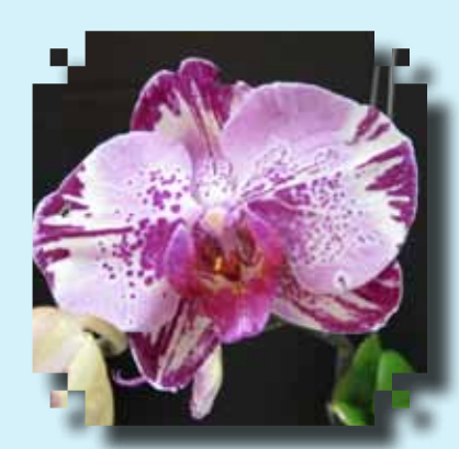
RED RIBBON Phalinopsis no ID Tracy Moulton