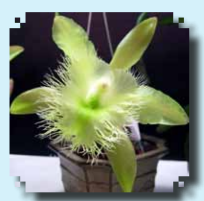
RED RIBBON Brassavola Digbyana Helene Albee

As a reminder, all plants brought in for the show table should be free of pests and diseases. Take some time to stake and clean the leaves of your plants, this allows for better presentation. Also, please do not bring newly-purchased plants for the show table. The show table is an outlet for members to share the great job they have done in growing and flowering their orchids; therefore, please respect the unwritten rule of owning and growing an orchid for a minimum of 6 months.