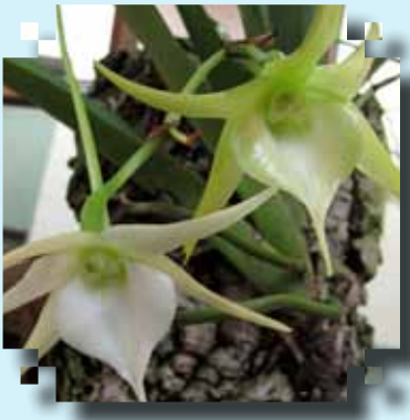
BLUE RIBBON Angraecum Crestwood Bob Beckoff