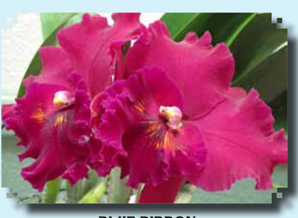
<u>BLUE RIBBON</u> Cat. RSC. Hay Song 'Tian Mu' Phyllis Durst