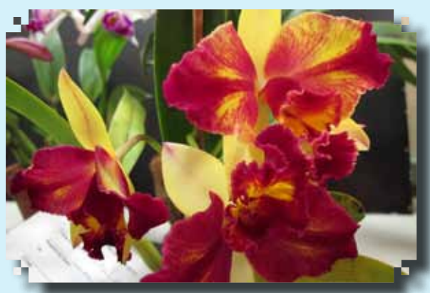
RED RIBBON Slc. Fire Majic 'Solar Flare' Phyllis Durst