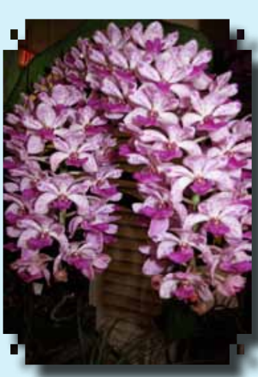
BLUE RIBBON Rhynchostylis Red Tony Blanc.