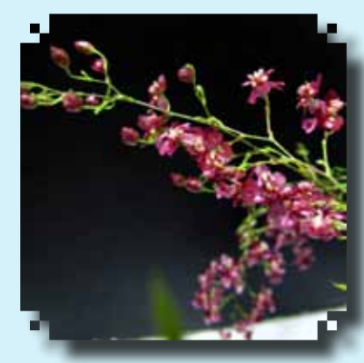
RED RIBBON ONC. Twinkle red Phyllis Durst