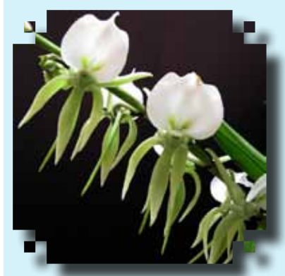
<u>BLUE RIBBON</u> Angraecum Super Bum Lori Parish