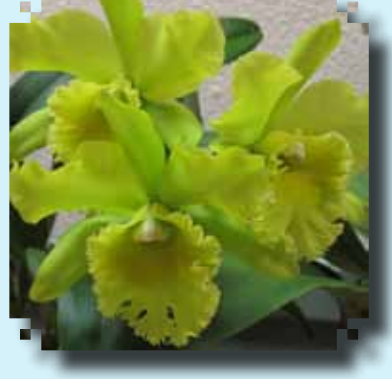
SPECIAL RIBBON Blc. Prada Green Deluxe 'Carib' Phyllis Durst