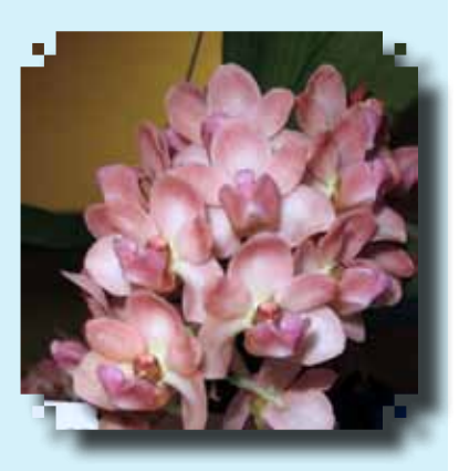
BLUE RIBBON Rhynchostylis Peach Tony Blanc