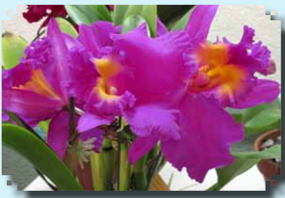
GREEN RIBBON Blc. Pink Empress 'Ju-Shen AM/AOS' Phyllis Durst