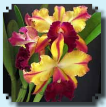
BLUE RIBBON Blc. Taiwan Gold 'Golden Oriole' Gigi Louis