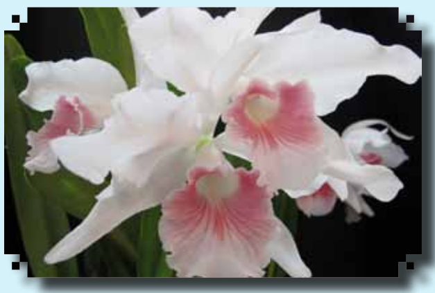
BLUE RIBBON L. Purpurata 'Carnea' Phyllis Durst