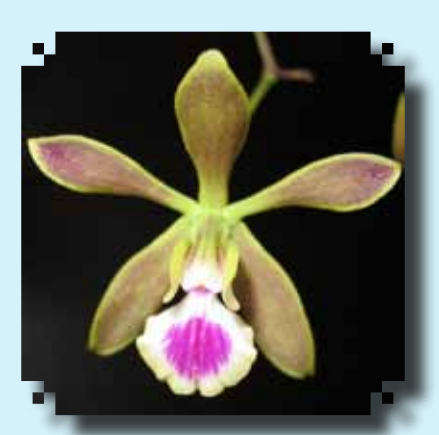
BLUE RIBBON Enc. Tampensis Lenide Pierre-Antoine