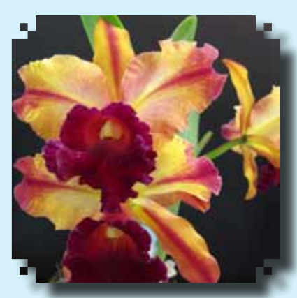
BLUE RIBBON Blc. Toshie Aoki 'Pizzaz' Joanne Buckley