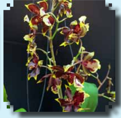
BLUE RIBBON Ocdm. Wildcat 'Golden Red Star' Tracy Moulton