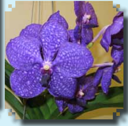
RED RIBBON V. Pachara Delight Lynn Molitor

As a reminder, all plants brought in for the show table should be free of pests and diseases. Take some time to stake and clean the leaves of your plants, this allows for better presentation. Also, please do not bring newly-purchased plants for the show table. The show table is an outlet for members to share the great job they have done in growing and flowering their orchids; therefore, please respect the unwritten rule of owning and growing an orchid for a minimum of 6 months.