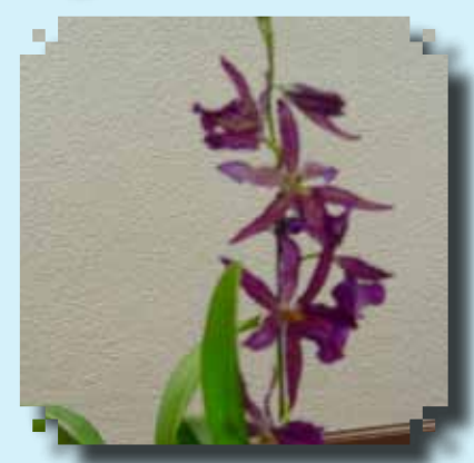
<u>RED RIBBON</u> Onc. Bllra Marfitch 'Howard's Dream' Gigi Louis