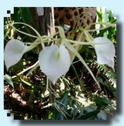
<u>BLUE RIBBON</u> Braddavola Nodosa Adorable Lynn Molitor