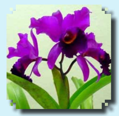
BLUE RIBBON Cat. Unifoliate (NOID) Elise Chapman