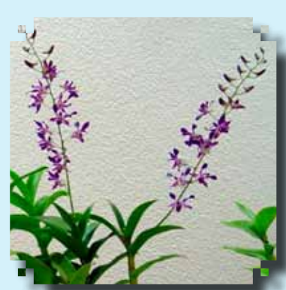
RED RIBBON Den. Blue Twinkle 'Carmela' Elise Chapman