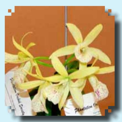
<u>RED RIBBON</u> BLC Golden Tang 'Red Beach' x BC Maikai 'Improved' Tom & Barb Van Strander