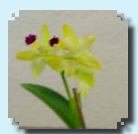
RED RIBBON Cat. Bi. Pot. Paradise Beauty 'Golden Angel' Karen Reynoldson

As a reminder, all plants brought in for the show table should be free of pests and diseases. Take some time to stake and clean the leaves of your plants, this allows for better presentation. Also, please do not bring newly-purchased plants for the show table. The show table is an outlet for members to share the great job they have done in growing and flowering their orchids; therefore, please respect the unwritten rule of owning and growing an orchid for a minimum of 6 months.