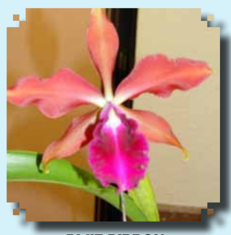
BLUE RIBBON Cat. LC Amphion 'Show Time' Phyllis Durst