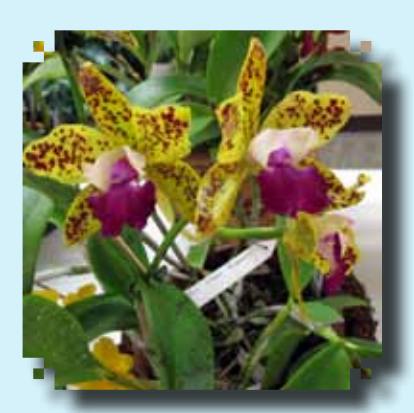
BLUE RIBBON Blc. Green Emerald Phyllis Durst

We were treated to a spectacular array of blooming babies in February!