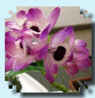
RED RIBBON Den. Nobile 'Sweet Candy' Tracy Moulton