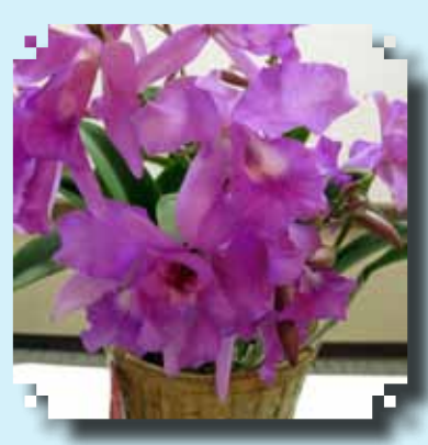
<u>RED RIBBON</u> BC Mai Kai 'Lee' x C. Skinneri 'Carpinteria' FCC/AOS