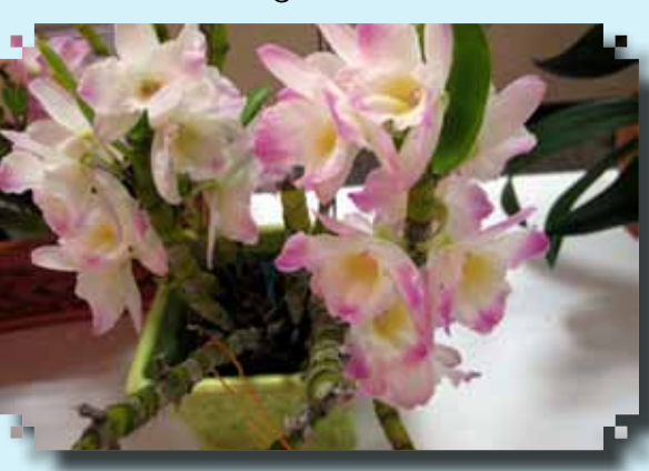
BLUE RIBBON Den. Spring Dream Helene Albee