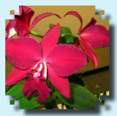
RED RIBBON C. Ann Komine 'Breathless' AM/AOS Phyllis Durst

As a reminder, all plants brought in for the show table should be free of pests and diseases. Take some time to stake and clean the leaves of your plants, this allows for better presentation. Also, please do not bring newly-purchased plants for the show table. The show table is an outlet for members to share the great job they have done in growing and flowering their orchids; therefore, please respect the unwritten rule of owning and growing an orchid for a minimum of 6 months.