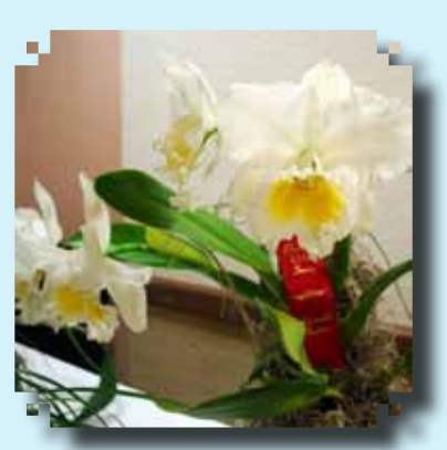
RED RIBBON C. White Diamond Gigi Louis