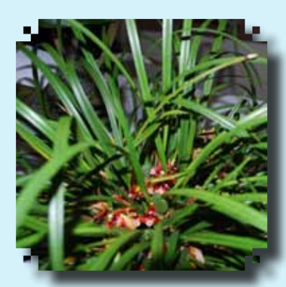
<u>BLUE RIBBON</u> Maxillaria tenufolia Lenide Pierre-Antoine