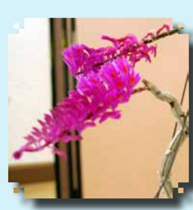
BLUE RIBBON Den secundum Tooth brush orchid Lenide Pierre-Antoine