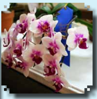
<u>BLUE RIBBON</u> Dtps. Fusheng's 'Gladlip' Joanne Buckley