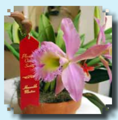
RED RIBBON BC Thortonii Phyllis Durst