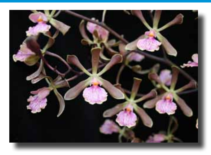
Our 2014 Photo Winner - Lynn Molitor

Guillermo said that minis are often used in hybridizing to extract the colors. A bright orange mini can make big cattleyas bright orange. Guillermo not only likes them for their uniqueness but also the fact that he can grow 400 plants in his Miami home.