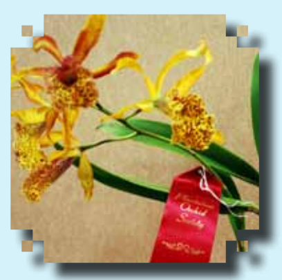
RED RIBBON Recchara Francis Fox 'Sun Spots' Beverly Warde

As a reminder, all plants brought in for the show table should be free of pests and diseases. Take some time to stake and clean the leaves of your plants, this allows for better presentation. Also, please do not bring newly-purchased plants for the show table. The show table is an outlet for members to share the great job they have done in growing and flowering their orchids; therefore, please respect the unwritten rule of owning and growing an orchid for a minimum of 6 months.