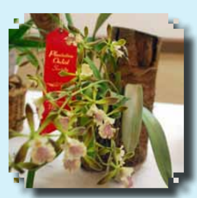
RED RIBBON E Alata 'Epijim X E. Green Glades 'Jerry Templet' Dot McCrain