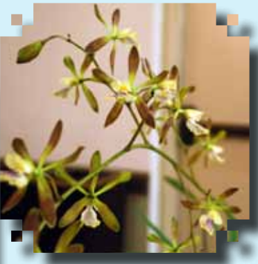
BLUE RIBBON E. Alata 'Epijim' HCC/AOS X E. Green Glades 'Jerry Templet' CCM/AOS Beverly Warde