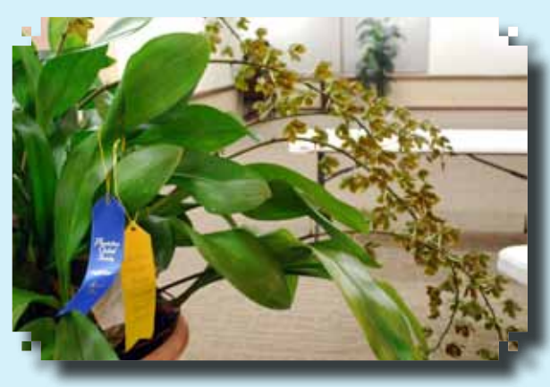
YELLOW/BLUE RIBBON Grammatophyllum W. Bill David