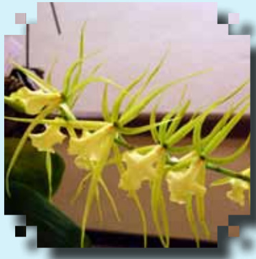
BLUE RIBBON Brassia Rex 'Waiomao Spotless' Lynn Molitor