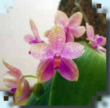
BLUE RIBBON Phal. Gigabell (Gigante X bellina) Gigi Louis