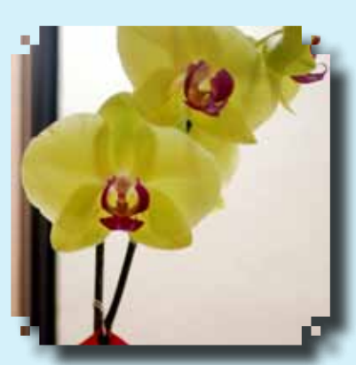
RED RIBBON Phal. Fuller's Sunset Beverly Warde