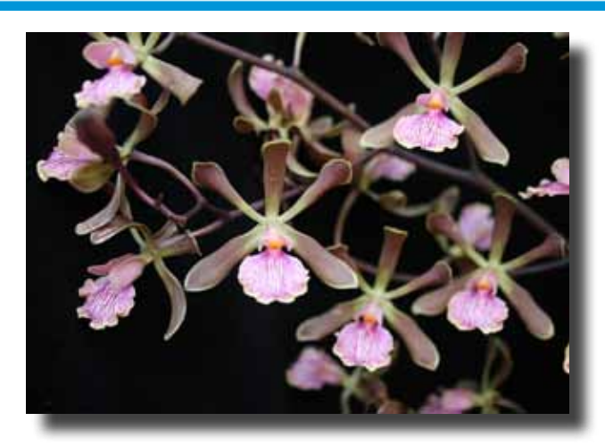
Our 2014 Photo Winner - Lynn Molitor