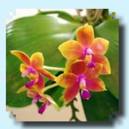
YELLOW RIBBON Phal. Guadalupe Gigi Louis