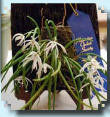
<u>BLUE RIBBON</u> Leptotes bicolor Gigi Louis