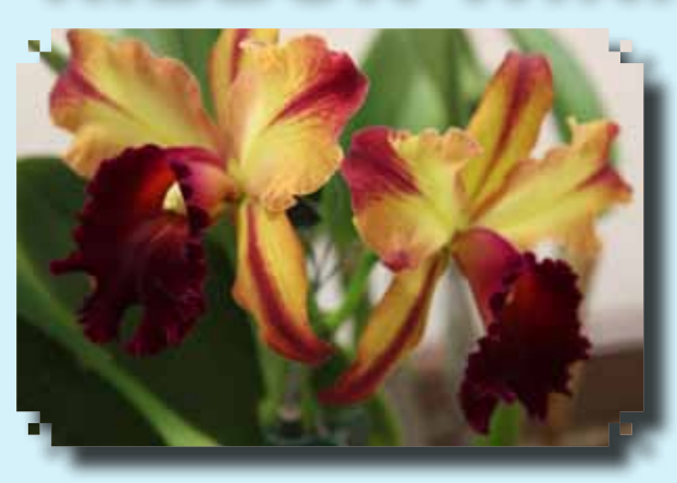
YELLOW/BLUE RIBBON Blc. Toshie Aoki 'Pizziaz' Karen Reynoldson