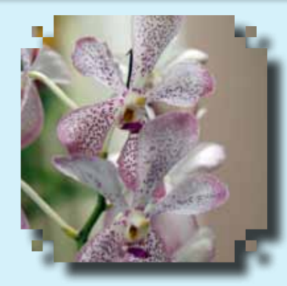
BLUE RIBBON V. aranda prapinspot Ernest Rose