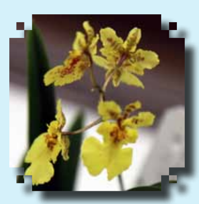
RED RIBBON Tum. Midas 'Willow Pond' Yellow Sue Dohn

As a reminder, all plants brought in for the show table should be free of pests and diseases. Take some time to stake and clean the leaves of your plants, this allows for better presentation. Also, please do not bring newly-purchased plants for the show table. The show table is an outlet for members to share the great job they have done in growing and flowering their orchids; therefore, please respect the unwritten rule of owning and growing an orchid for a minimum of 6 months.