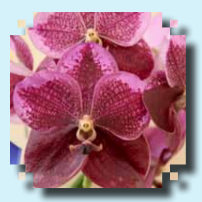
BLUE RIBBON V. Fuch's Delight 'Black' x V. Pimchai Beauty No. 1 Mary Lee Tabeling