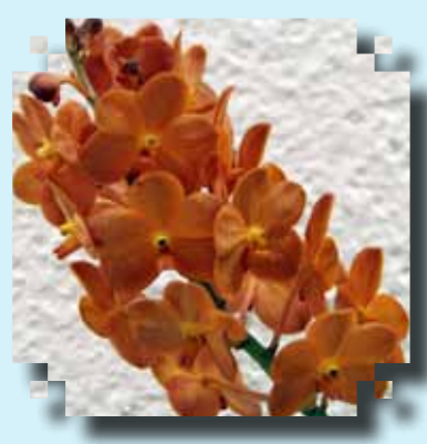
<u>BLUE RIBBON</u> Ascda. Suksamaram Sunlight Bob Bekoff