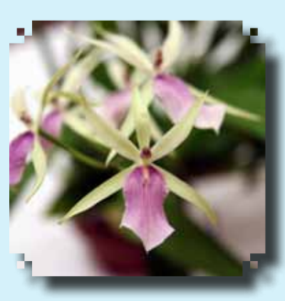
BLUE RIBBON Mtssa. Estrelita 'Sweet Senorita' Sue Dohn