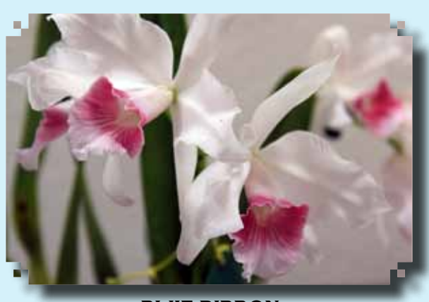
BLUE RIBBON L. purpurata 'Carnea' Phyllis Durst