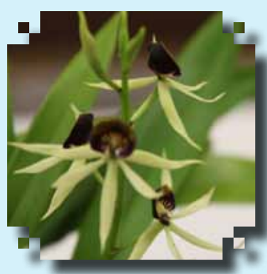
BLUE RIBBON Epi. Green Hornet (Cochleatum Spy Hill x Lancifolium) Elise Chapman