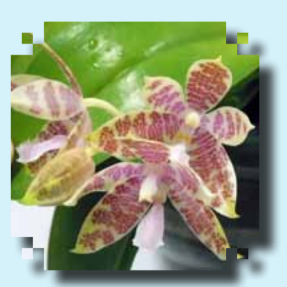
<u>GREEN RIBBON</u> (species)Phal.hieroglyphica Gigi Louis