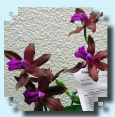
GREEN RIBBON (species) C. bicolor Gigi Louis