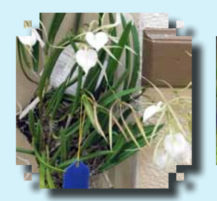
BLUE RIBBON Ribbon B. nodosa 'Adorabil' Phylus Durst