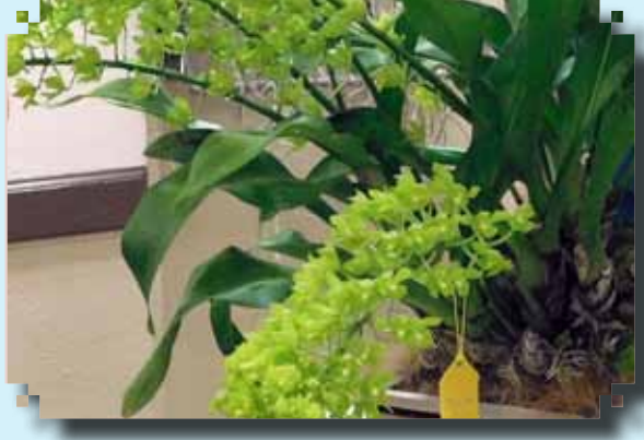
<u>YELLOW CULTURE RIBBON</u> Gram. citrinum Paul & Francisco