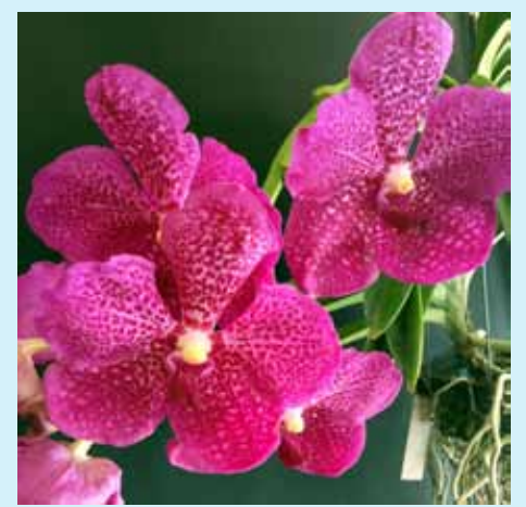
Ascda. Krailerk White x V. Wirat