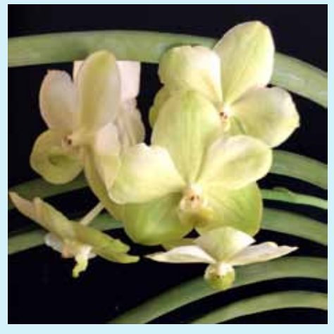
Ascda. Kultana White Wing x V. sanderiana 'alba'