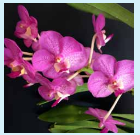
Aerides lawrenciana x_Ascda. Meda Arnold

Other plants not in bloom are: Dend. Emma White, Paph. Crown Jewel 'Super Nova' x Paph. Thunder Eagle 'Top Gun', Renanthera storii x V. Doctor Anek, Paph. primulinum x Paph. bellatulum (Two of these), Vanda Tumtim (Two of these), Ascda. Nongnutch x AscdaBetty May Steel (Two of these), Dend. spectabile, Vanda hybrid NOID