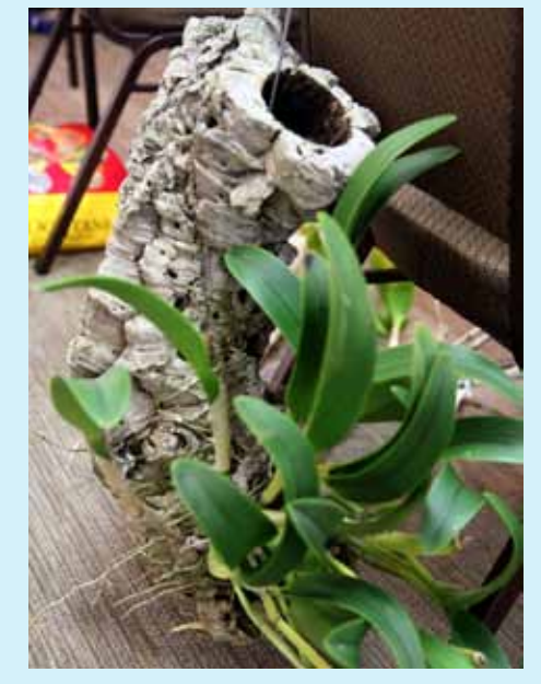
Beautiful mounted on Large cork