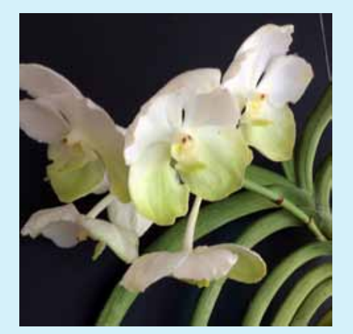
V. Rasri Gold x Ascda. Krailerk White