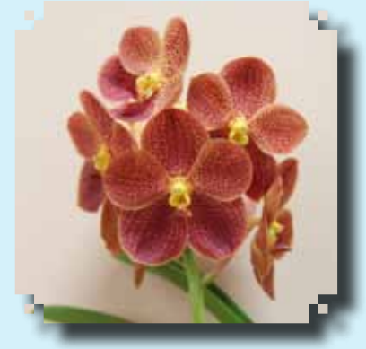
<u>RED RIBBON</u> Ascda. Kultana Papillon Elise Chapman

As a reminder, all plants brought in for the show table should be free of pests and diseases. Take some time to stake and clean the leaves of your plants, this allows for better presentation. Also, please do not bring newly-purchased plants for the show table. The show table is an outlet for members to share the great job they have done in growing and flowering their orchids; therefore, please respect the unwritten rule of owning and growing an orchid for a minimum of 6 months.