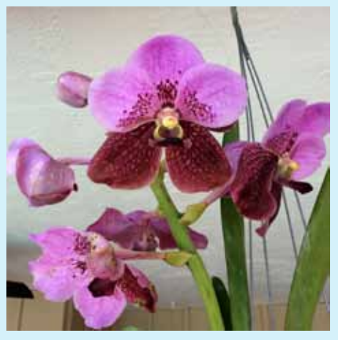
V. Taweeksuksa x V. sanderiana