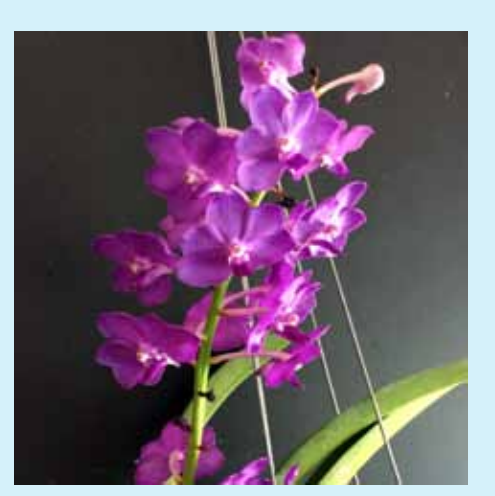
V. Pine River Blue