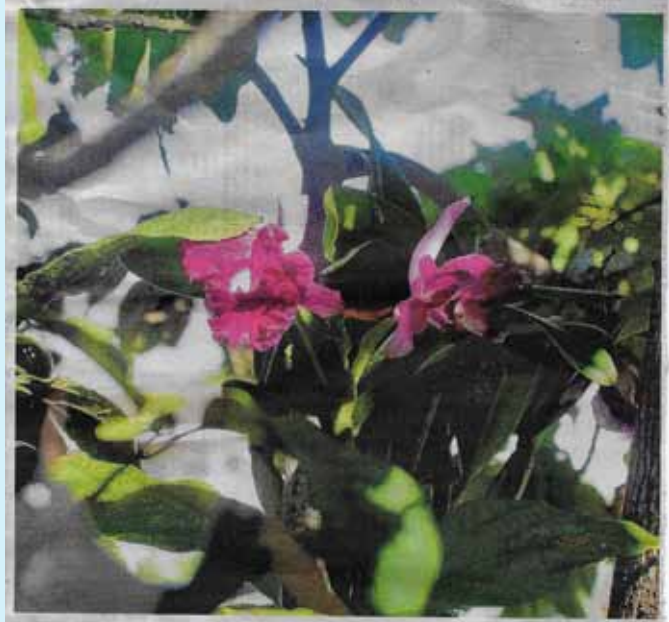
IN BLOOM The Plantation Orchid Society holds competitions and participates in

Individuals interested in joining can visit Planta-tionOrchidSociety.org for more information.