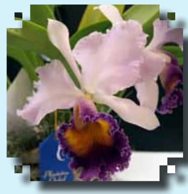
BLUE RIBBON C. Dinard 'Blue Heaven' Peggy Geria