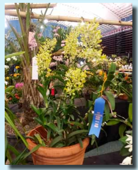
CONGRATULATIONS Karen Reynoldson On Your Blue Ribbon!