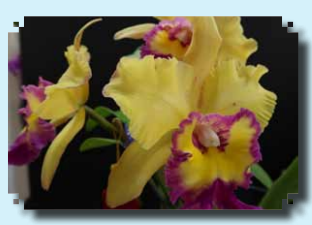
RED RIBBON Blc. Young Kong 'Sun No. 16' Phyllis Durst