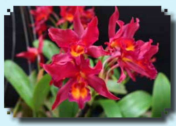
YELLOW/BLUE RIBBON C. War Paint Lynn Molitor