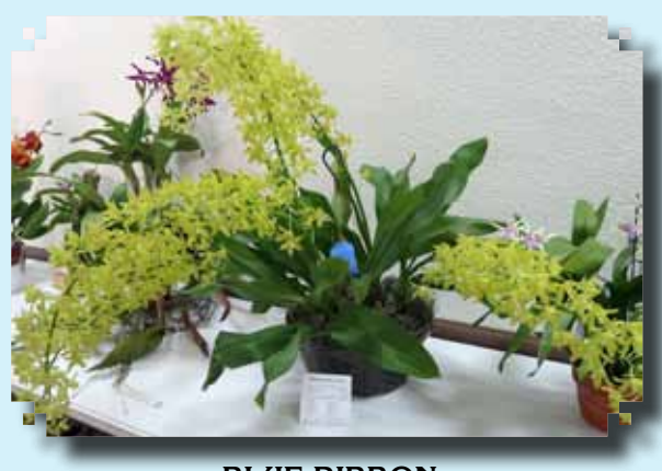
BLUE RIBBON Gram. scriptum var. citruinum 'Hibimanu' AM/AOS Marissa Gittelman