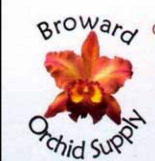
Aseda, Ben's Delight

WE'RE NOT JUST FOR ORCHIDS - SUPPLIES FOR ALL YOUR GROWING NEEDS