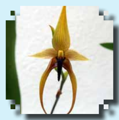
BLUE RIBBON Bulb. Carunculatum x Paluense Fancisco & Paul