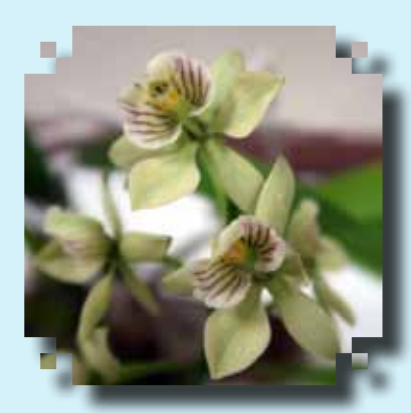
<u>BLUE RIBBON</u> Encylia fragrans species Marissa Gittelman