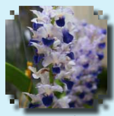
BLUE RIBBON Rhy. Coelstis Blue Lip Elise Chapman