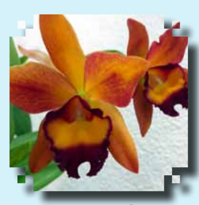
BLUE RIBBON Cat. Sweet Orange Marlene Isaacs