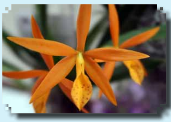
YELLOW RIBBON PVC. Golden Peach Elda Scott