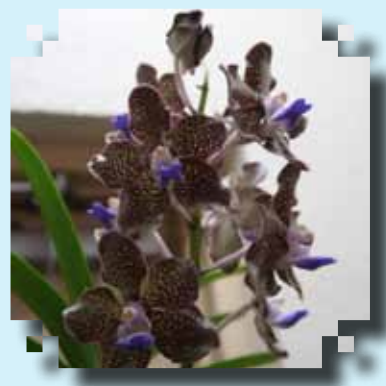
BLUE RIBBON V. Arjuna (tesselata x Mimi Palmer) Francisco & Paul

As a reminder, all plants brought in for the show table should be free of pests and diseases. Take some time to stake and clean the leaves of your plants, this allows for better presentation. Also, please do not bring newly-purchased plants for the show table. The show table is an outlet for members to share the great job they have done in growing and flowering their orchids; therefore, please respect the unwritten rule of owning and growing an orchid for a minimum of 6 months.