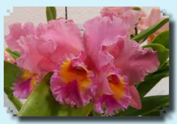
RIc. George King 'Serendipity' AM/AOS Peg Geria

As a reminder, all plants brought in for the show table should be free of pests and diseases. Take some time to stake and clean the leaves of your plants, this allows for better presentation. Also, please do not bring newly-purchased plants for the show table. The show table is an outlet for members to share the great job they have done in growing and flowering their orchids; therefore, please respect the unwritten rule of owning and growing an orchid for a minimum of 6 months.