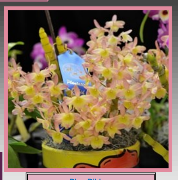
Blue Ribbon Den. Spring Bird 'Kurashiki' Michele