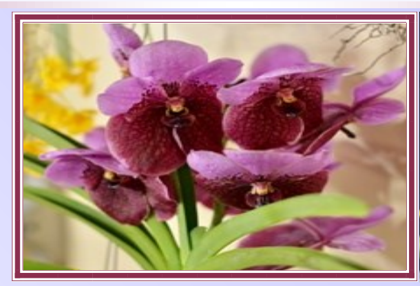
Blue Ribbon V. Taweesuks x sanderiana Michelle