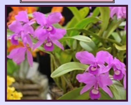
Blue Ribbon Gur. skinneri Phyllis Durst

As a reminder, all plants brought in for the show table should be free of pests and diseases. Take some time to stake and clean the leaves of your plants, this allows for better presentation. Also, please do not bring newly-purchased plants for the show table.