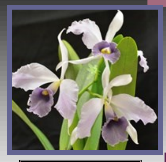
Blue Ribbon Lc. C.G. Roebling 'Blue Indigo' Phyllis Durst