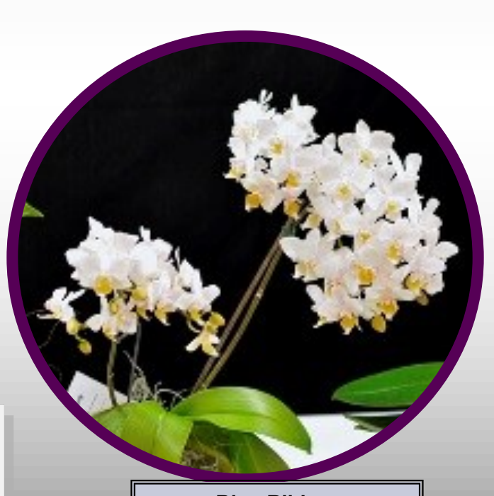
Blue Ribbon Phal. Artemis Phyllis Durst