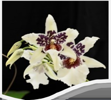
Red Ribbon Bllra. Big Shot 'Hilo Sparkle' Ernest Rose