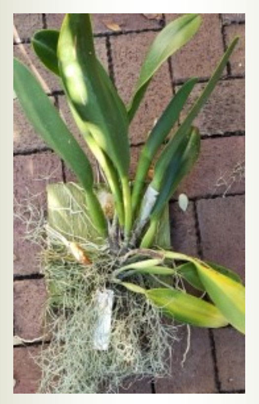
An established Cattleya on a cedar plank