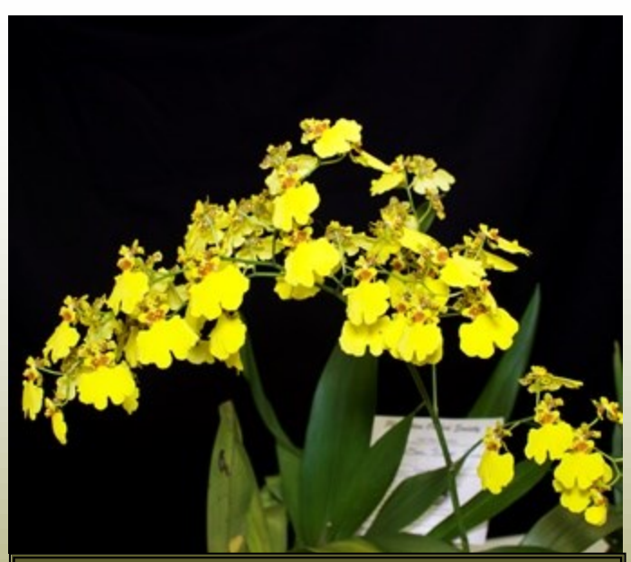
Blue Ribbon Onc. Sweet Sugar