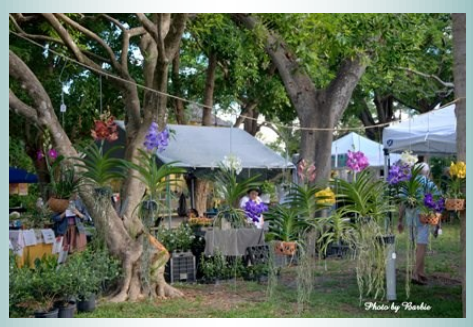
12th Annual Bonnet House International Orchid & Garden Festival Saturday & Sunday, April 6 & 7, 2019 from 9am – 4pm.

The Festival will allow orchid enthusiasts, and plant lovers in general, the opportunity to vividly experience — and purchase — diverse, colorful and fragrant varieties of orchids, tropical plants, herbs and fruit trees sold by local and for the first time international vendors from Thailand, Malaysia, Ecuador and Hawaii. The orchids and tropical plants, though, are only the beginning. This exciting two-day event will offer something for everyone to enjoy, including orchid and tropical plant displays, food vendors, libations, garden art, orchid care and general gardening lectures, book signing with Dr. Martin Motes and a lecture on The Million Orchid Project with Dr. Jason Downing, live performances by the Pride Steel Band & Daniel Clocanas Music and much more!