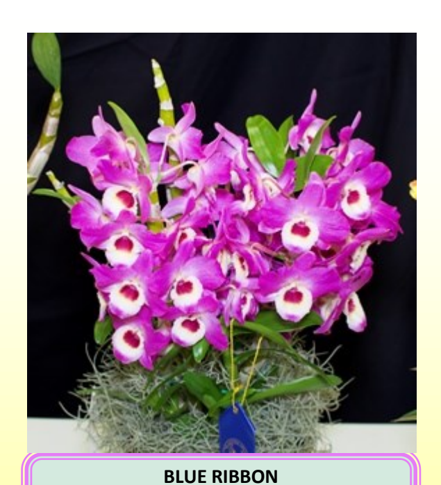
Den. Country Girl 'Warabeuta' Carole Schwimmer