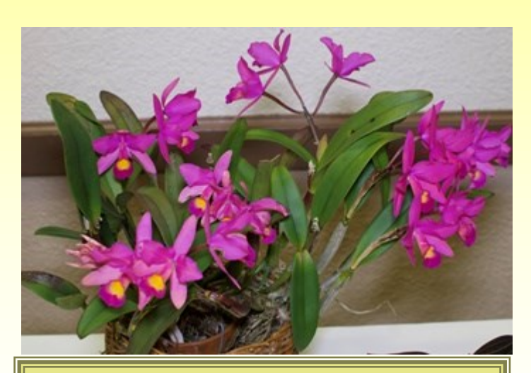
RED RIBBON C. Caribbean 'Orange Treat' x lawrenceana